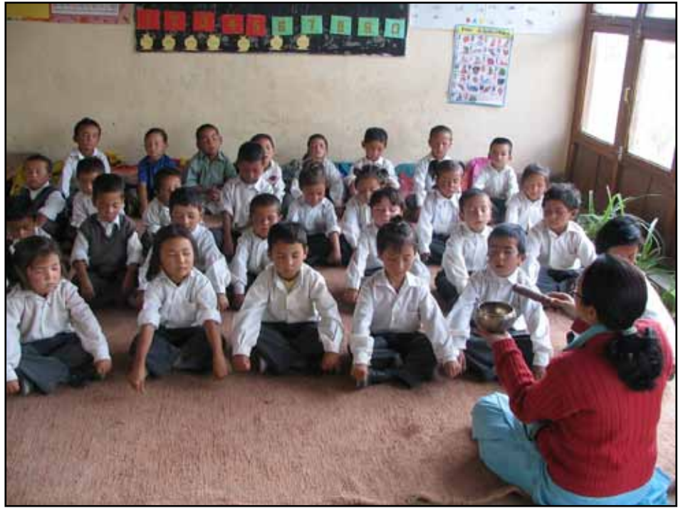
Pre-Kindergarten Students learning meditation at Siddhartha School

The mantra "Om Mani Padme Hum" floated through my consciousness as a smile spread across my face. As I let the vision and thoughts go, my heart