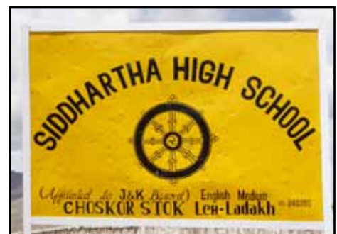
Siddhartha School's new sign

We need to raise an additional $25,000 to help complete these projects. Please consider a donation to support these improvements and ensure Siddhartha School retains its accreditation.