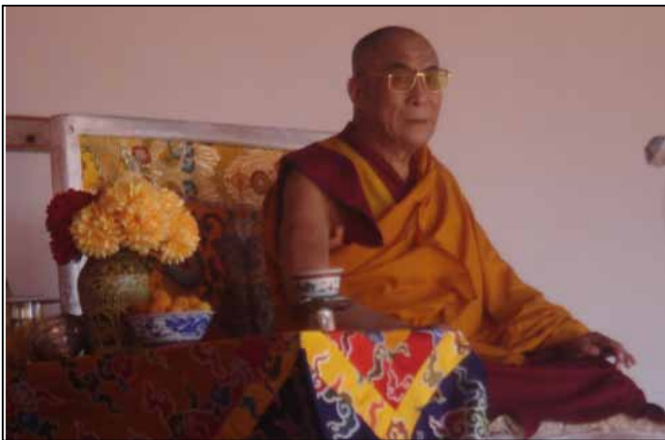
His Holiness the 14 th Dalai Lama at Siddhartha School