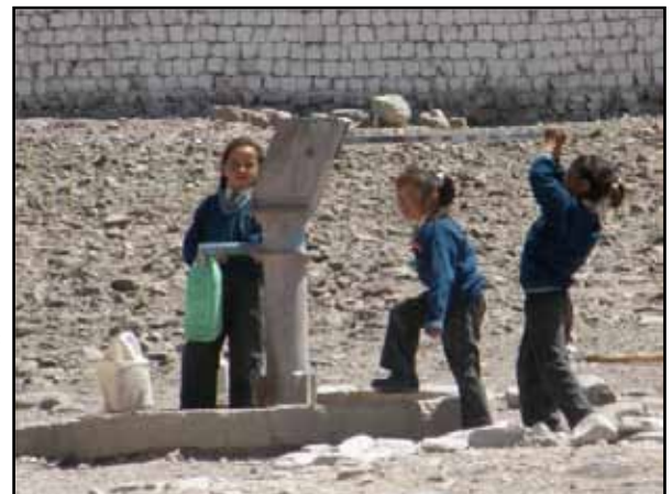
Everybody pitches in to pump water

Would you prefer to receive Siddhartha School Project correspondence via e-mail? If so, please send your e-mail address along with your name and other contact information to ssp@siddharthaschool.org . Please ask friends to send their information also – we need your help to spread the word about Siddhartha School.